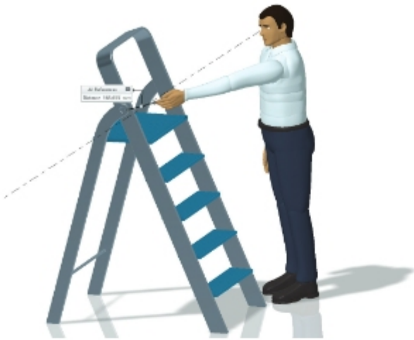
Visualize human interaction and identify clearance issues early in the design process