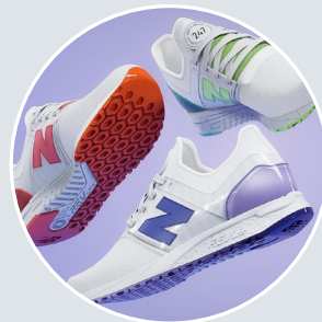
Material Management & CMF Output

3D Paint allows you to further customize your product's material and finish by painting or stamping directly on the surface of your model. Add wear marks, create unique surface weathering, or layer effects to create more realistic surface patinas to any surface within your scene.